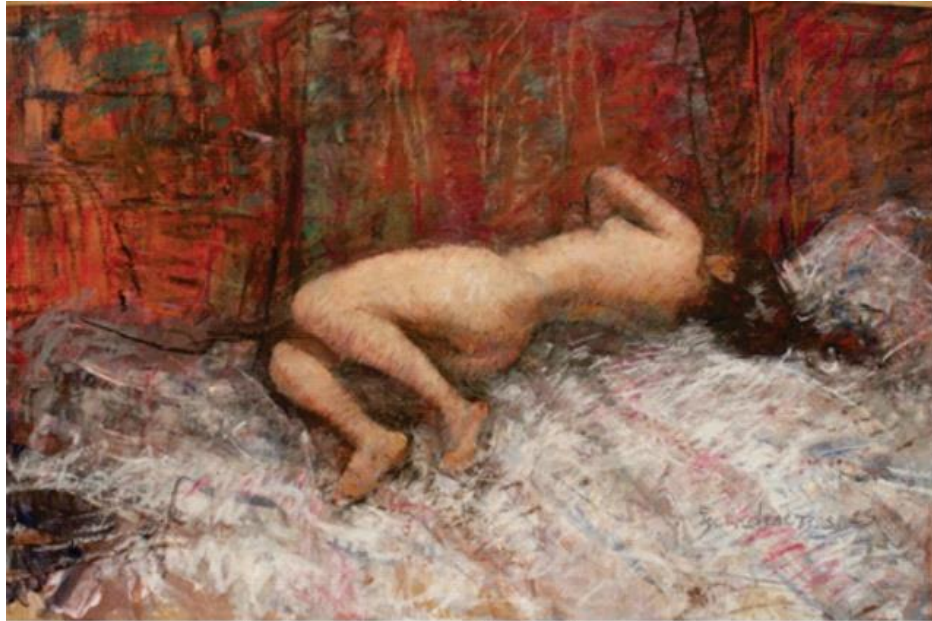
“On the couch”, cardboard pastel, 25.5x38, 2023.