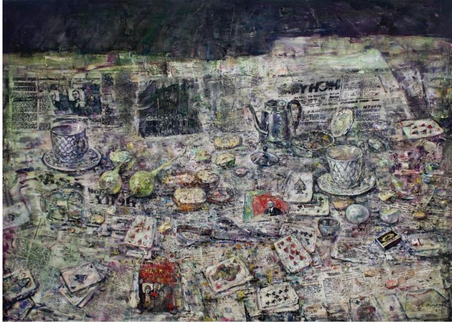
“Celebration of last May 1”, oil on canvas, 120x85, 2023.